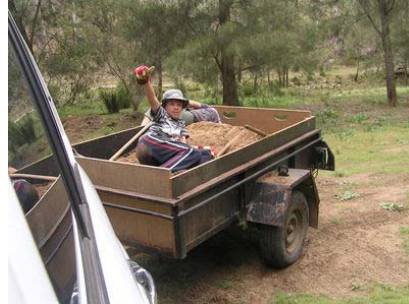
Chilling out on the dirt