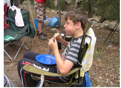
Enjoying a well earned lunch

After filling the holes we returned for lunch of toasted sandwiches, ham cheese and tomato cooked over the fire. After cleaning up it was back to filling more holes, a few hours of doing this and it was time for afternoon tea biscuits, fruit and cordial. We still had a few more hours of daylight to continue with some badge work then it was time to stop for dinner, which was beef stew YUM!!