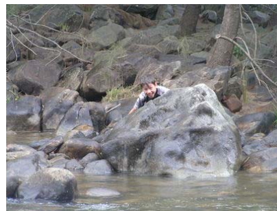
Oh no he got the photo

We then showered to warm ourselves up the water in the river was freezing. We had dinner consisting of pasta, fish and corn on the cob. We sat around the fire having desert of chocolate pudding and cream. We finished washing up and getting ready for bed when it started to rain so we sat under the marquee talking about the days events. Then off to bed for a well earned rest.