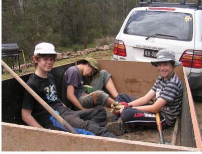
Off to work