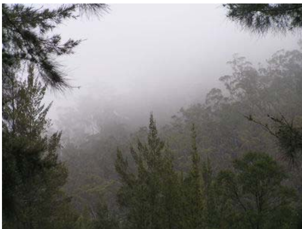
The foggy view