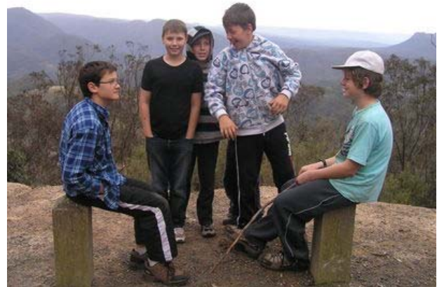
Taking in the sites