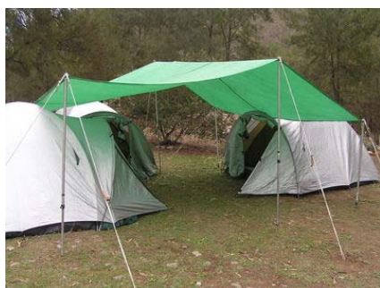
Our sleeping quarters