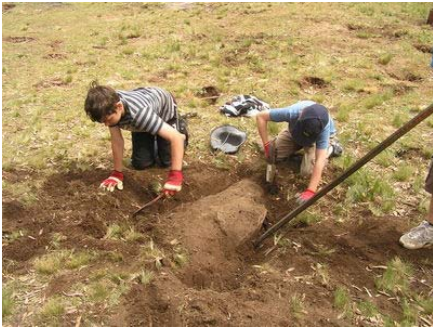
Dig, dig, dig.

We then went to the working bee, we were all given tools to go dig up rocks.