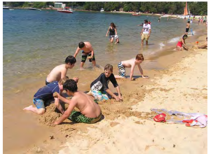
Enjoying Balmoral Beach