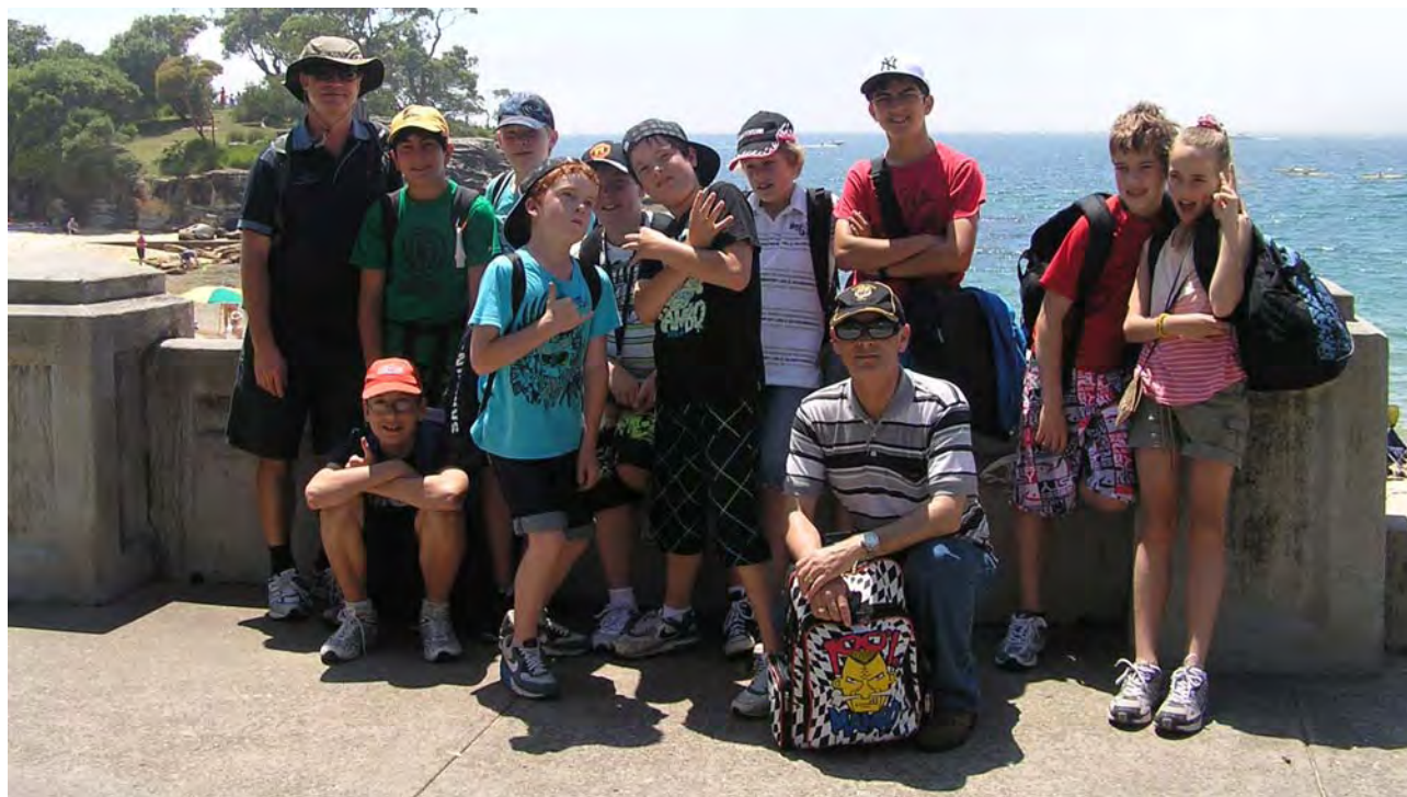
The expedition team on the esplanade at Balmoral Beach.

From the Zoo wharf we caught the bus to Balmoral Beach and walked along the esplanade under the shade of huge old trees. We could see Middle Head shrouded by sea fog.