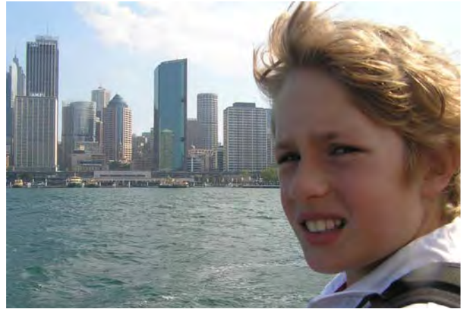
Harbour cruise back to Circular Quay

Back at Circular Quay we had afternoon tea by the harbour and then a short walk to the Rocks markets where we split into smaller Patrols for independent exploration.