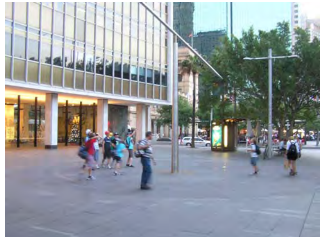
Monument to Scouting in Scout Place

From the Quay we walked up to Martin Place enjoying the colourful Christmas decorations and caught the train back to Sutherland and finally bus to Bangor, arriving back 12 hours after departure. I knew the Scouts had a great adventure when one asked if we could do it again. It was a great day out and thanks to all the participants.