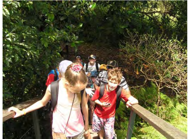
Climbing away from Balmoral Beach

A short 2km walk climbed some steps to the ridge top and along to Middle Head where we entered the fog and walked under a grey sky. It was amazing to see the sea fog racing up the hill side in the strong breeze.