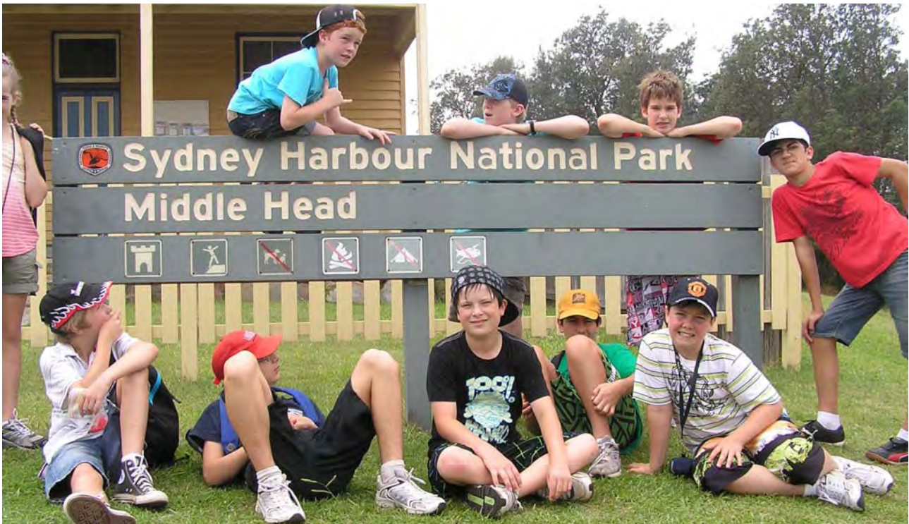
National park entrance.

A short 2km walk climbed some steps to the ridge top and along to Middle Head where we entered the fog and walked under a grey sky. It was amazing to see the sea fog racing up the hill side in the strong breeze.