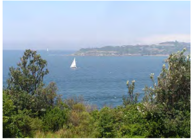
Views from lunch spot

After lunch we did the 2km walk back to Balmoral Beach and enjoyed a swim on a glorious summer afternoon.