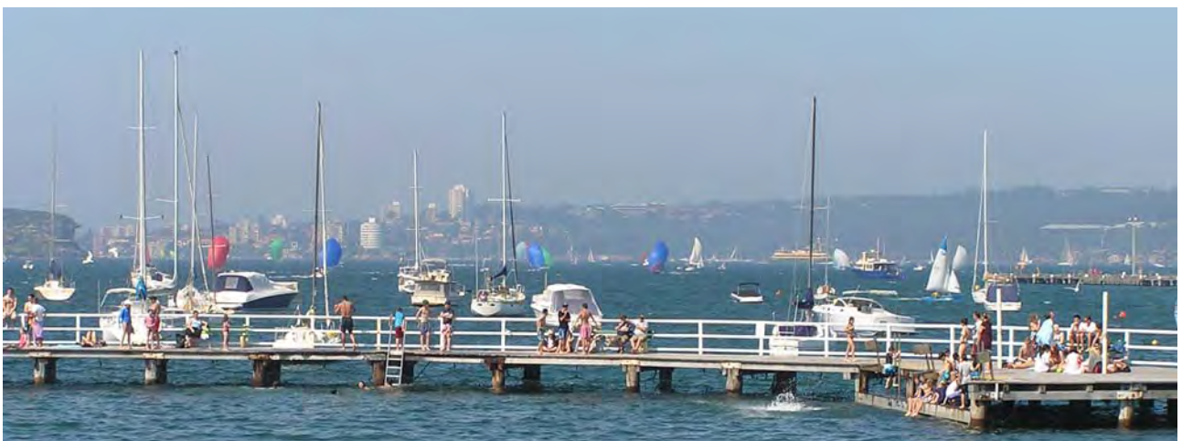
Harbour full of sails from Balmoral beach