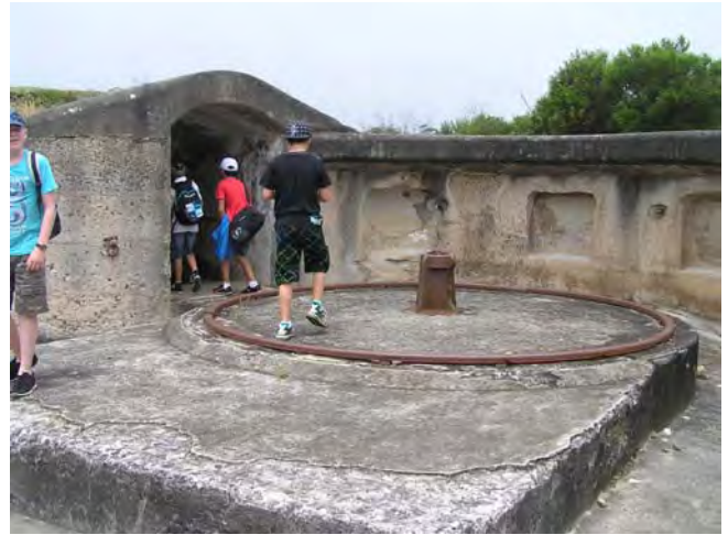
Hand cut into the rock