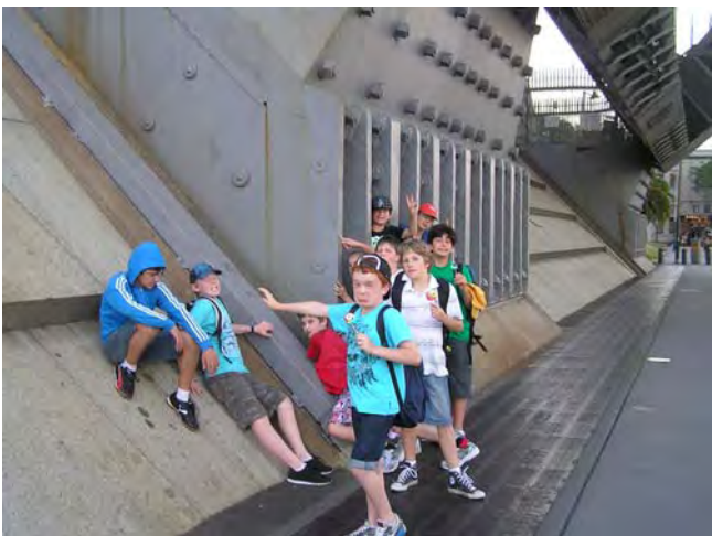
Holding up the Harbour Bridge

After a filling dinner we walked to the foot of the Harbour Bridge pylon and saw the pin that held the entire weight of the bridge. Then we followed the shore walking back around Circular Quay enjoying the magnificent harbour and city views. In front of the AMP building in Scout Place we saw the recently opened monument to Scouting.