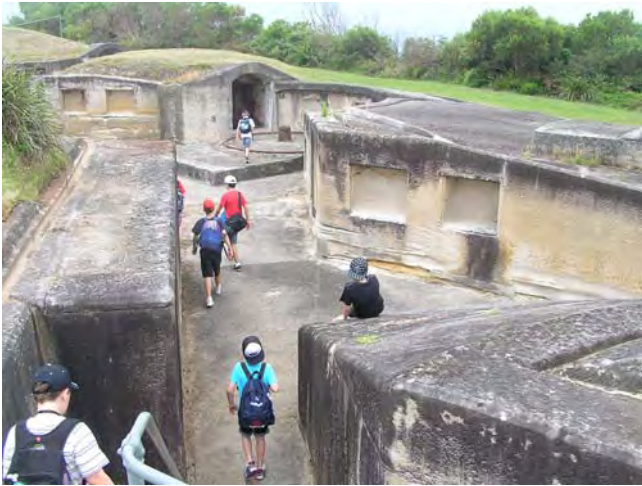
Circular gun emplacements from 1871