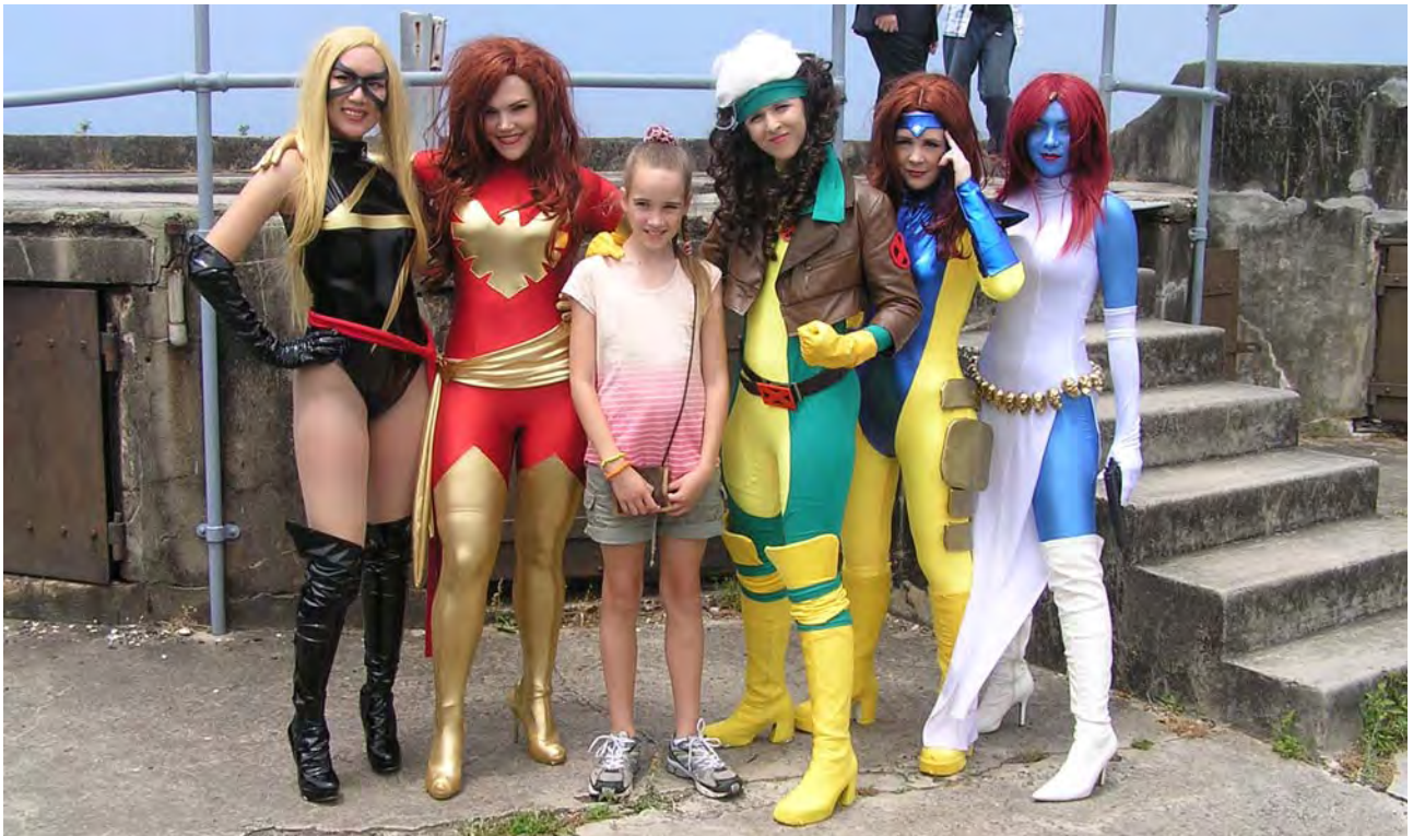
Wonder Woman and friends from X-Men