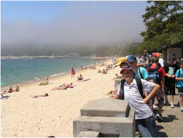
Middle Head in sea fog behind Balmoral Beach