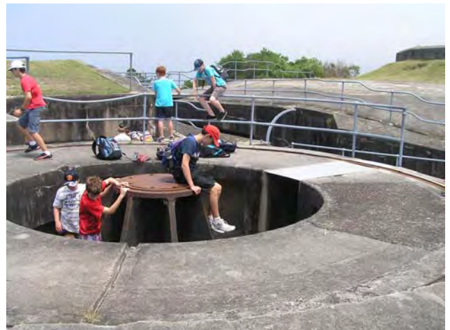
Six inch gun site